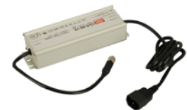
Water-proof Power Adapter (63040-030080-000-RS)