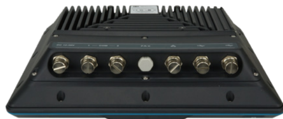
M12 IO cover