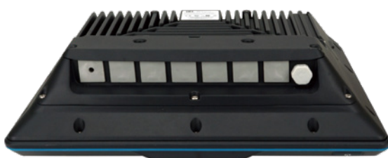
Standard IO cover