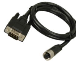
DB-9 COM port Cable (CB-M12COM-R20)