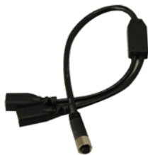
USB cable (CB-M12USB02-R20)