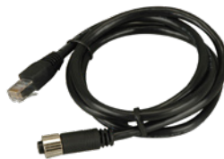
RJ-45 LAN cable (CB-M12RJ45-R10)