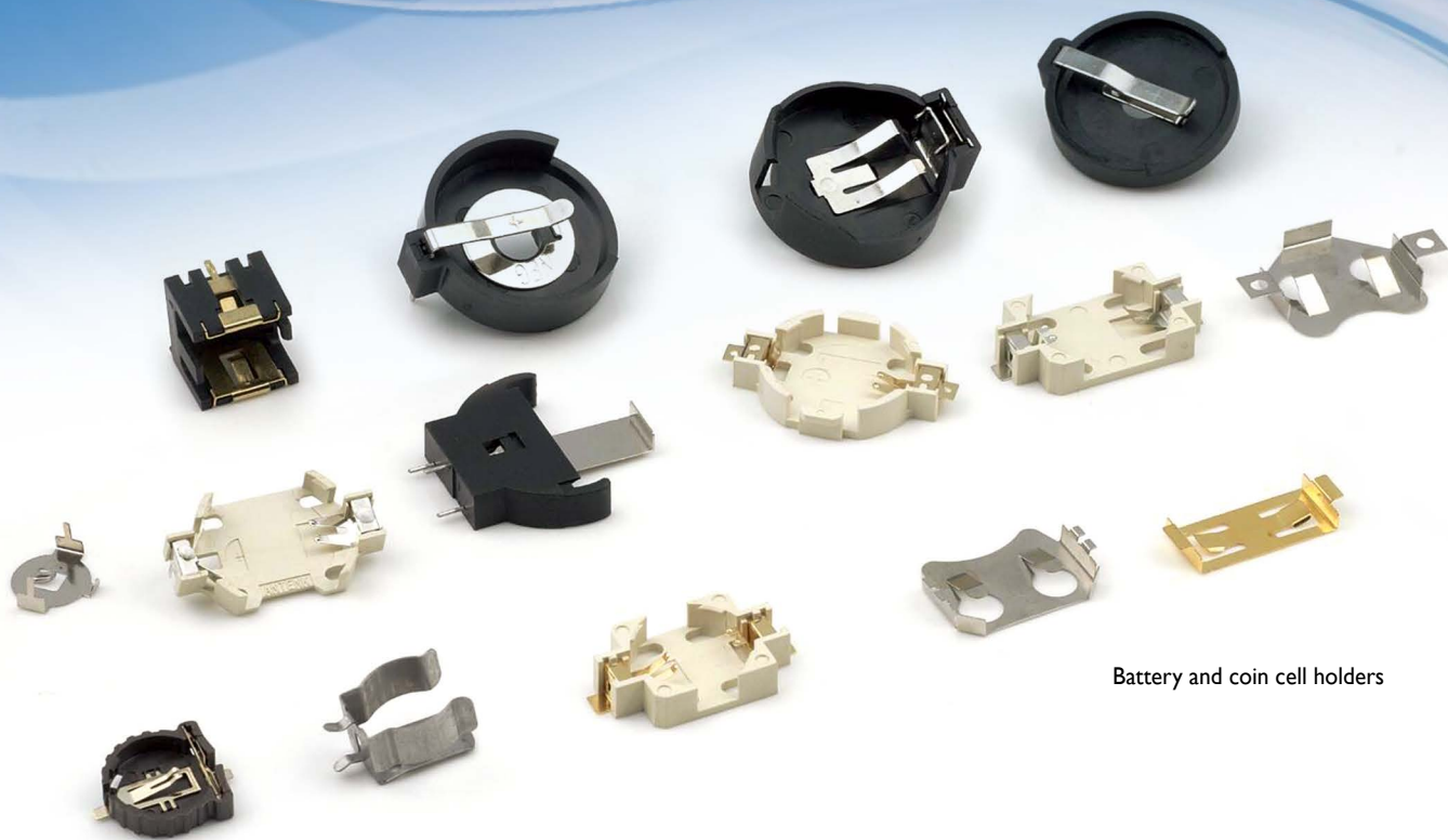
Battery and coin cell holders