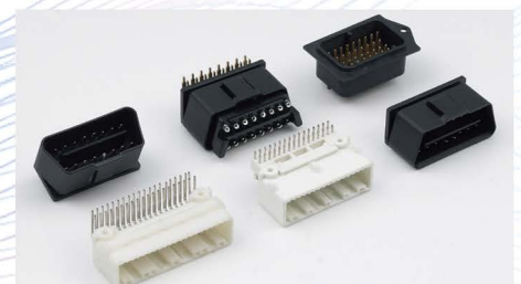
OBD and automotive connectors